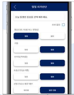
<Self-quarantine Safety Protection(APP)>